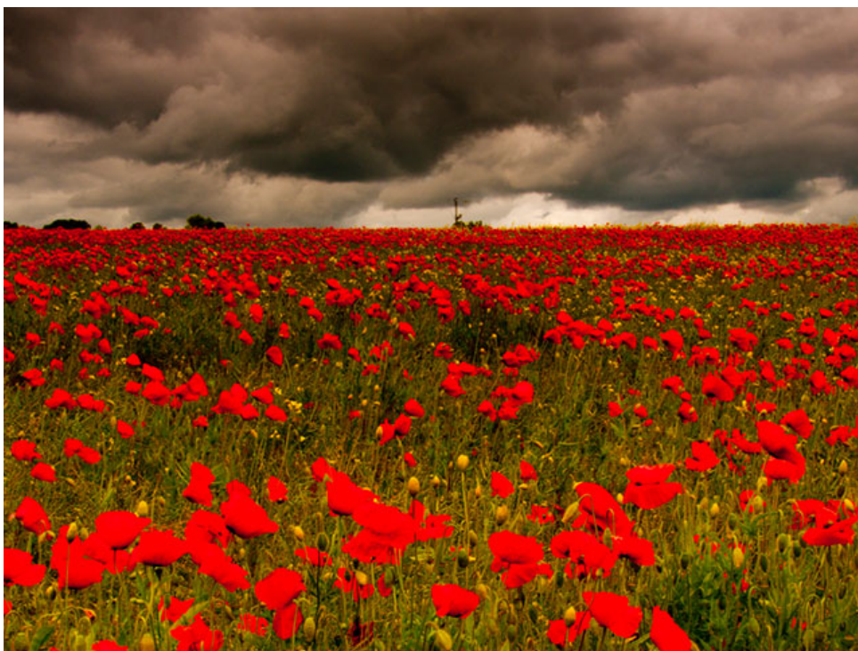
Poppy Field

Check the CC licence each time for conditions of use. We are on version 4 now but earlier licences are in common existence and may have slightly different conditions. For example version 2 requires you to provide the title of the image if available, as I have done in images 1 and 3, and indicate if any changes have been made (image 3 has been cropped slightly).