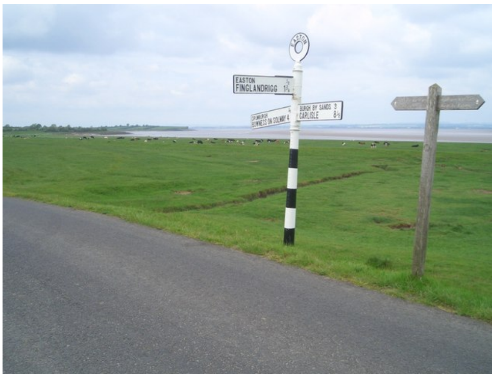
Road Junction & Hadrian's Wall Path

When you have found a suitable image, provide details of the source of the image together with a link to the appropriate licence. If the image is in the public domain, state this. Just as with text you are quoting, you should provide your readers with the opportunity to visit the original source of the image; even in the case of an image which states 'no attribution required', it's 'nice' and more professional to do so. There are examples below.