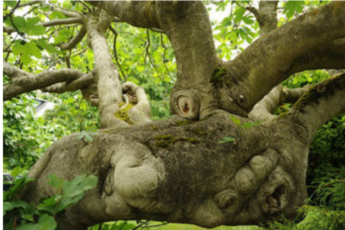
Alien Fig Tree

The owner of the image should be credited and a link provided to the source, together with a link to the licence deed. (Earlier licences may require the name of the image too – check the appropriate deed).